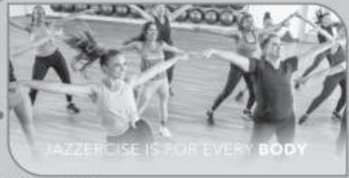
JAZZERCISE IS FOR EVERY BODY

Wilstone Village Hall Monday 9.30am Tuesday 6.00pm Wednesday 9.30am Thursday 9.00am, 9.30am and 6.00pm Friday 9.30am Saturday 9.00am